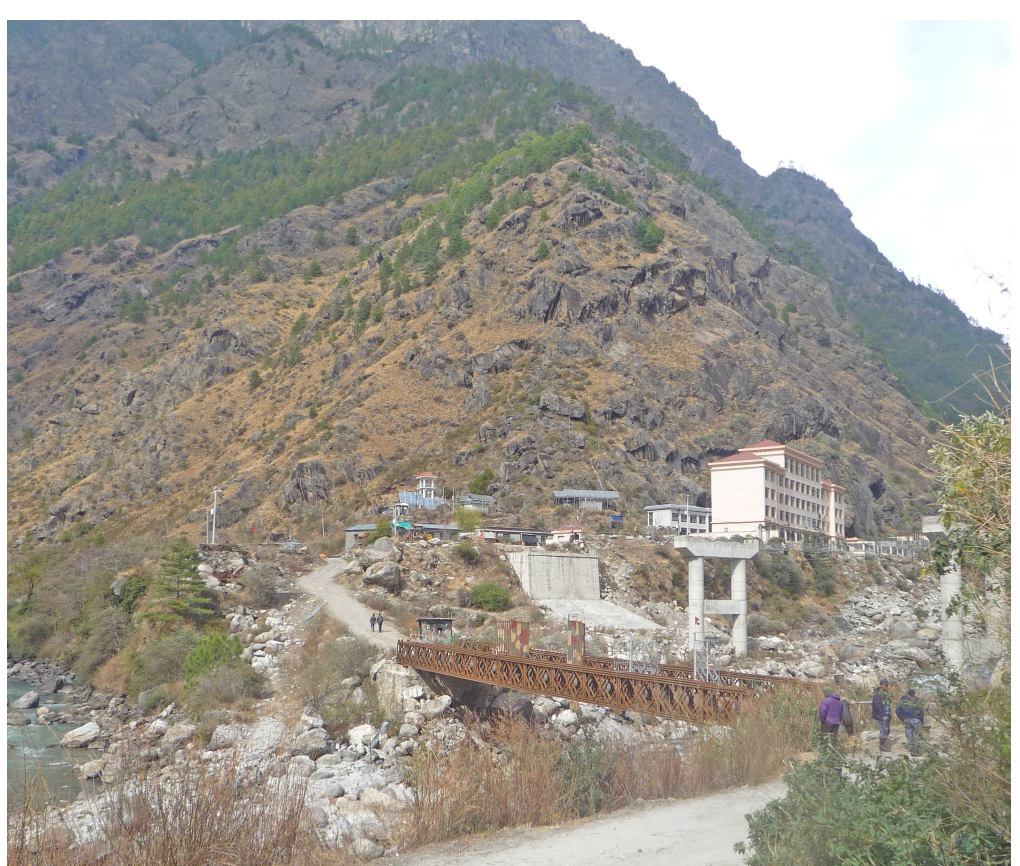
Figure 2: The river junction in 2013. Behind the temporary military-style bridge are the concrete supports for the new fly-over bridge. The five-storey structure was built recently and extensive building work is still going on.