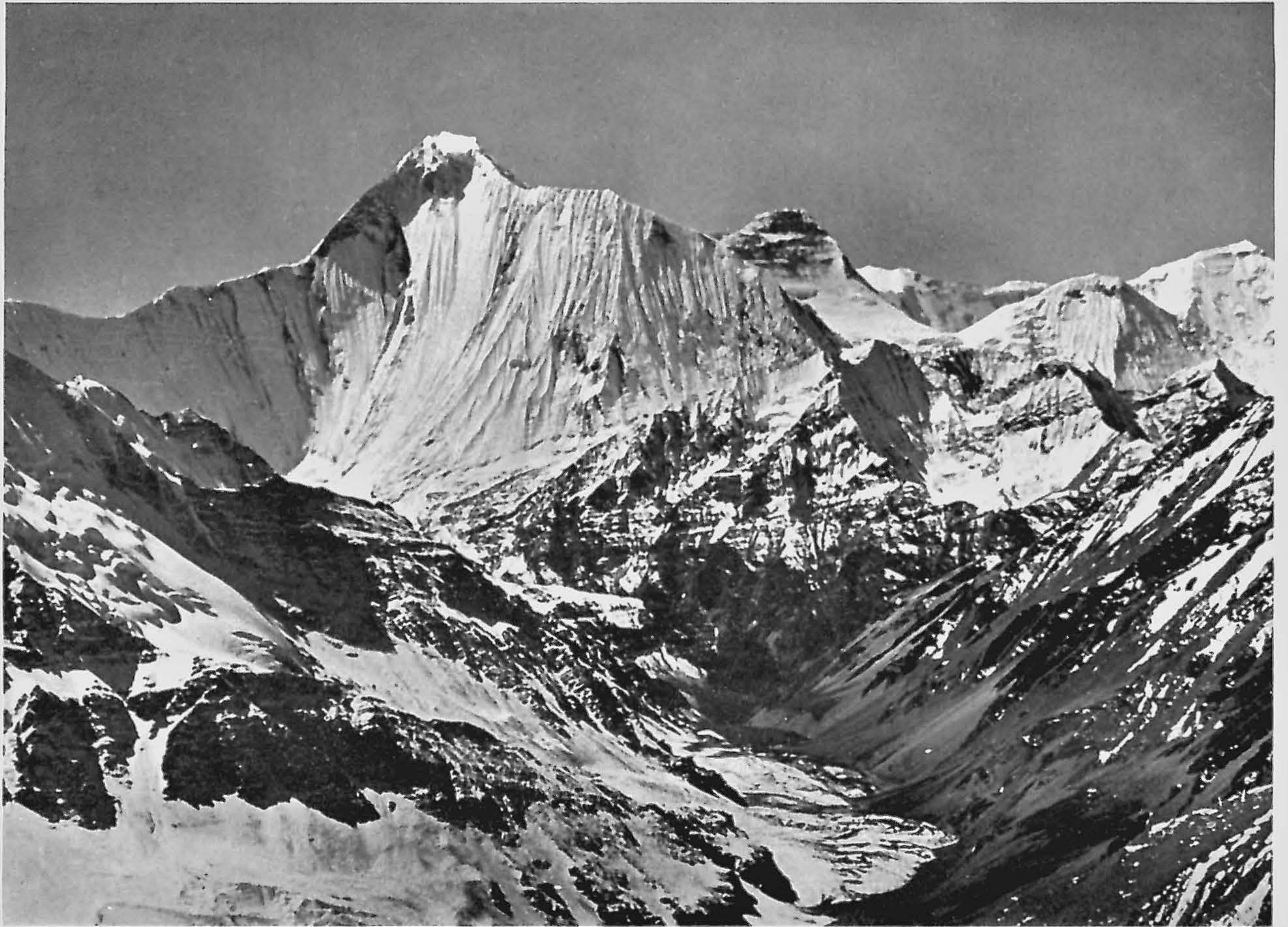
DHAULAGIRI II AND IV FROM THE EAST.