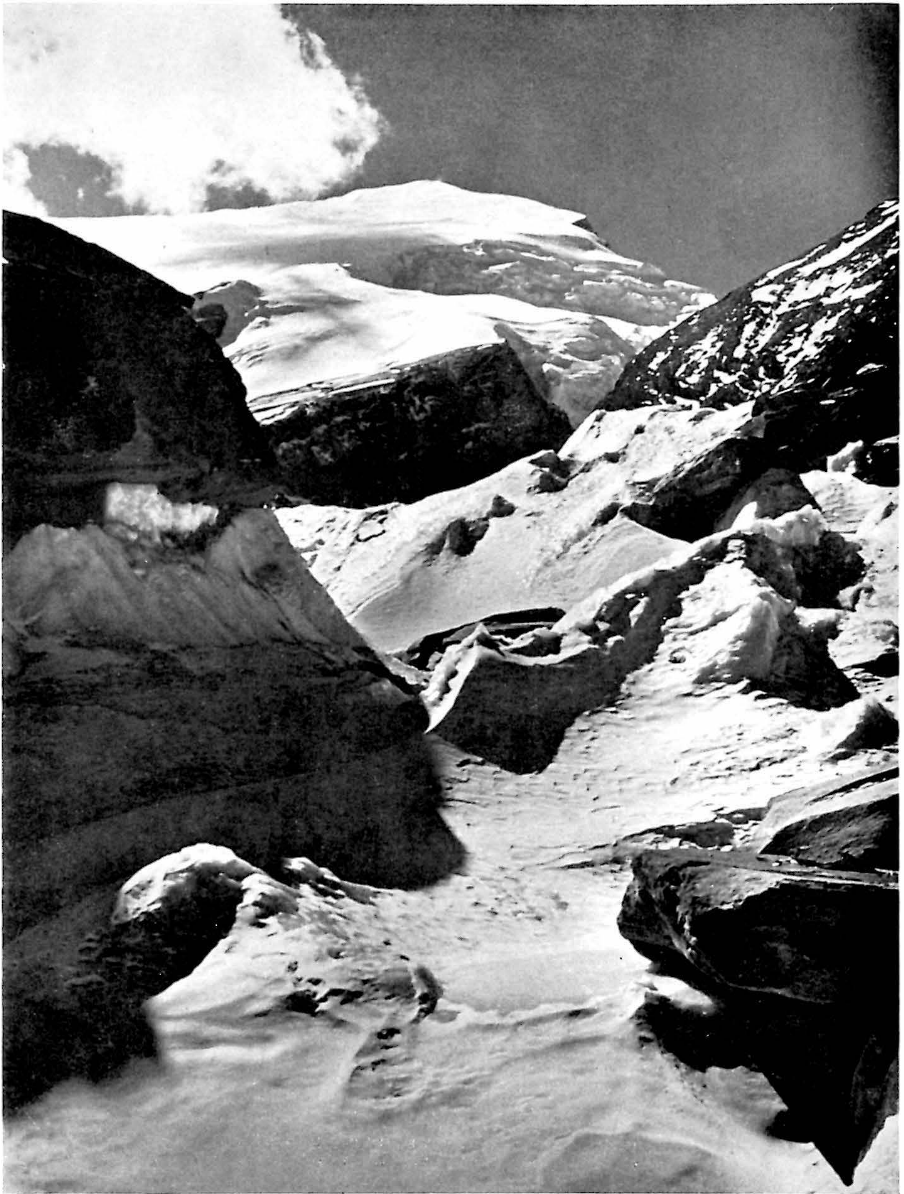
PUTHA HIUNCHULI FROM THE HEAD OF THE KAYA KHOLA.