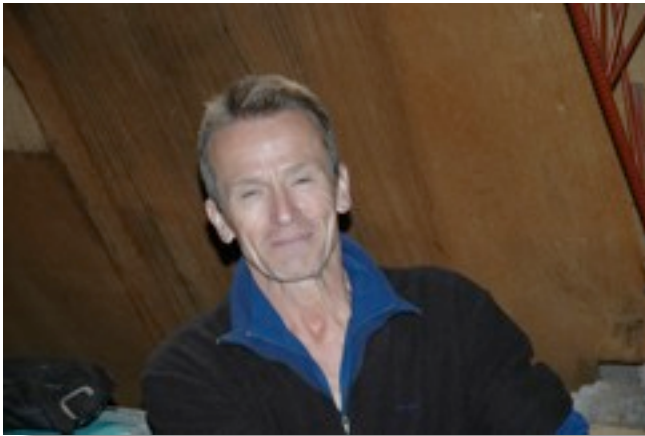
Alfred Nyby