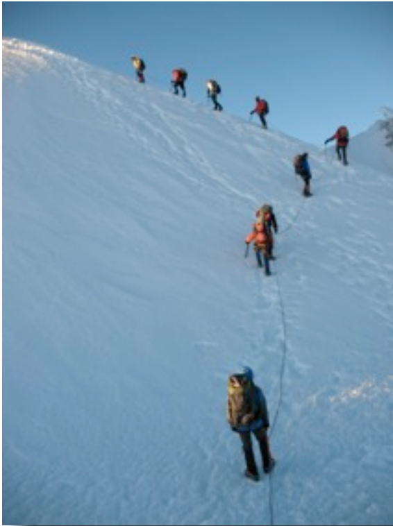
Climb up Cotopaxi

The rest of the group continued on up and I think they made the summit around 8 or 9. It sounded like it was a very challenging steep climb. They said that the exposure wasn't too bad although they did use a running belay on the return. After hearing the stories and seeing their pictures, I definitely want to go back to Ecuador and try this one again.