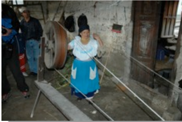
Stay out of her way

He was working over a large vat with blue dye. An aunt (or some relation) also did a demonstration of how they spin the wool into yarn. She was an incredibly happy woman who thoroughly enjoyed showing us “how it’s done”.