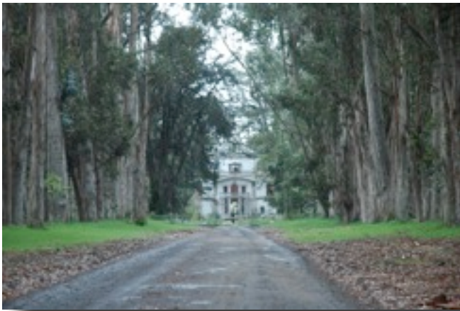
Early Morning at La Cienega