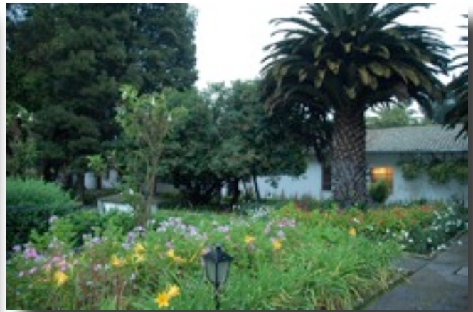
Amazing Gardens of La Cienega

Maybe at some point in the future when I've had my fill of climbing vacations – I'll do a hacienda tour in Ecuador. The grounds were beautiful with all kinds of color. We had a little bit of rain when we arrived so it seemed to be even greener. We all cleaned up and met in the bar for a quick drink.