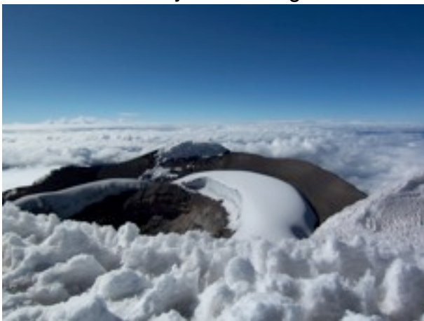
Summit of Cotopaxi

The rest of the group continued on up and I think they made the summit around 8 or 9. It sounded like it was a very challenging steep climb. They said that the exposure wasn't too bad although they did use a running belay on the return. After hearing the stories and seeing their pictures, I definitely want to go back to Ecuador and try this one again.