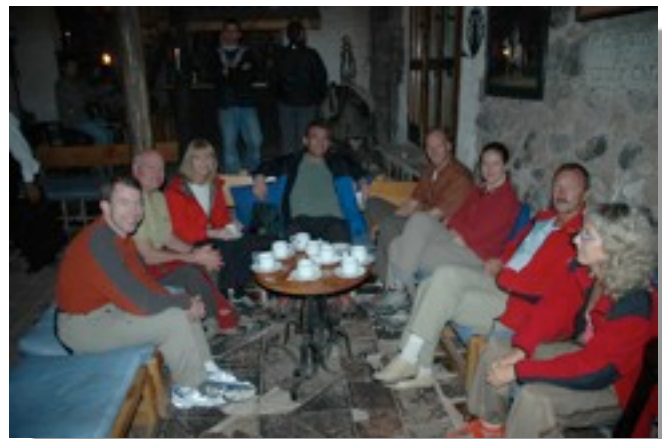
Time for refreshments!