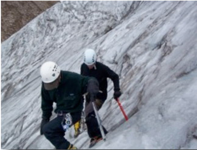
Just walk this way