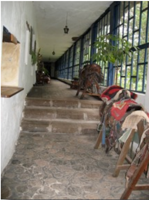
Hacienda Guachala - Janet s home for a couple of days

We headed out on the road to Cayambe and were again amazed at the road we would take. Probably the most dangerous part of the trip was the bus ride on these single lane roads with the steep drop-offs as they wind up the valley into the mountains. But we got to the end of the road without incident. Romulo had arranged for a 4-wheel drive truck to take all our gear up to the hut so we had a pretty easy hour hike up to the hut – arriving just at dark. By the time we got our bunks situated, Phil and Romulo had a light dinner ready for us. We were all pretty worn out so we were in bed around 8 or so. I slept very well that night – no headache from altitude and had been able to eat and drink well over the last couple of days. So I was starting to feel pretty optimistic about my chances of making it up this mountain.