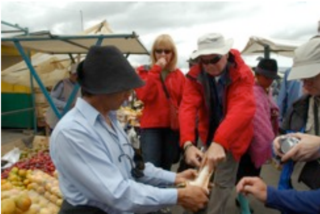
Try some of this