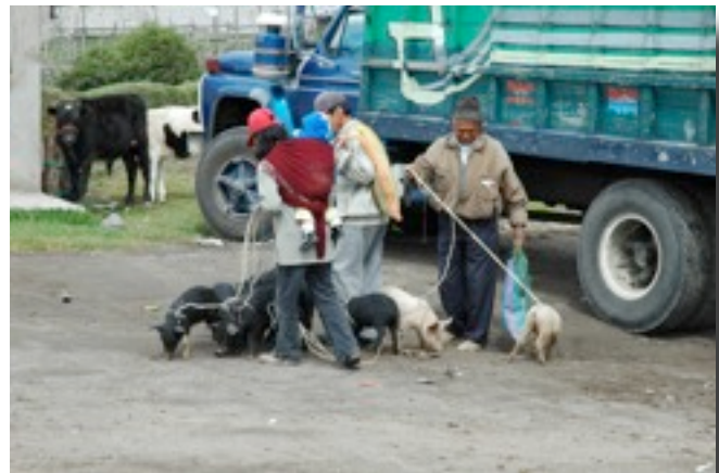
Do you think they'll sell them all?

We wandered thru the fruits and vegetables with Romulo buying different fruits for us to sample. There really weren't too many other tourists in this section of the market – this was where the local go to shop. While we all stuck out like sore thumbs, I really felt like we were really experiencing Ecuador in a way that most tourists don't.