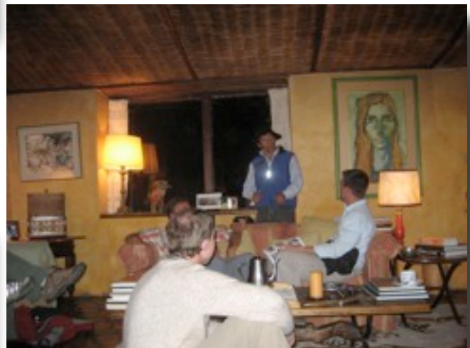
Do you believe these stories?

This would be a great place to spend a few days - especially if you're looking for a romantic get away. Each room is unique with fireplace that open into the main room and the bathroom. It would definitely be a great place to be pampered after a climb of Cotopaxi. We had dinner in the wonderful dining room – very nice!