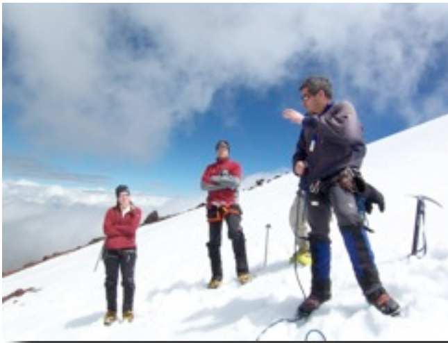
Of course – it s all intuitively obvious

When they returned, we stored a lot of the gear in a locker at the refuge so we wouldn't have to carry it back up the next day and headed back down to the bus and VolcanoLand.