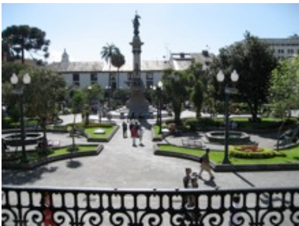
Walking tour of Quito