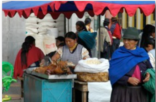
Looks like lunch!

We moved back up the road thru the rest of the “grocery store” stands of pig heads, fruits, vegetables and canned goods to the edge of the tourist section. But we had not yet had breakfast – so of course we needed to stop and eat. We ate a small café with outdoor seating looking down on the market. Phil attempted (again) to “keep it simple” by just ordering scrambled eggs and juice. Of course – we had to be complicated by mixing in a few omelets and bacon into the mix. After eating – we spent a couple of hours shopping (some of us came back with more than others) and then it was back to the hotel to pack up and head back to Quito.