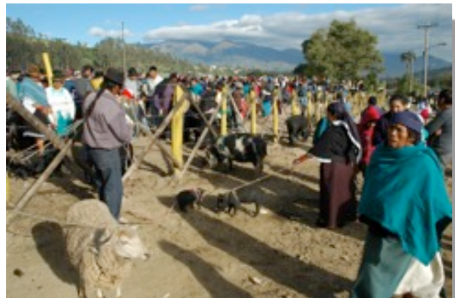
Otavalo Animal market

I think a few in our group weren’t sure about heading out to the animal market so early – but it’s a must for anyone who wants to experience Ecuador’s culture.