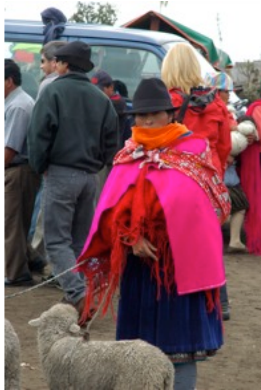
Saquisili Indian Market