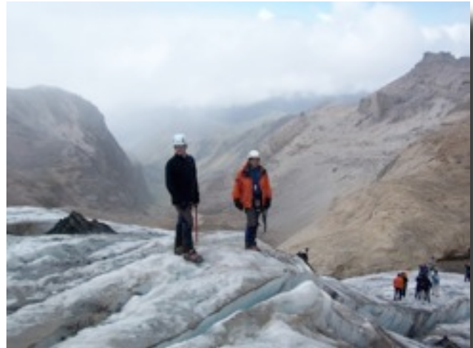
It s easy – once you get the hang of it

The next day was a relatively easy day. We would do some more practicing on the nearby glacier and get to bed early. Phil and Romulo put on a short ice climbing clinic – demonstrating different ways to go up and down the ice.