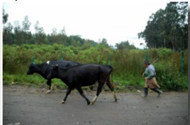
Early morning on a country road outside of La Cienega

We had another great dinner at La Cienega and were entertained by another Indian pan flute ensemble. It was the end to a very, very long day for most of the group and I know that they all welcomed the comfortable beds.