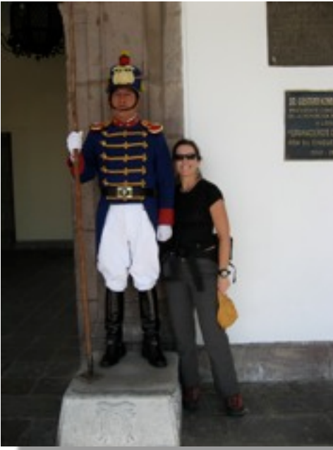
Amazing – I can't make him smile!