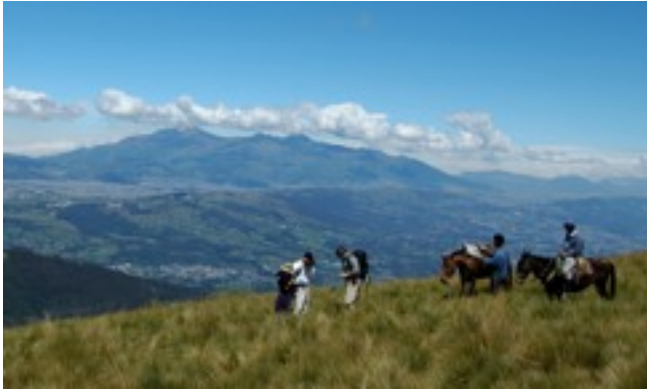
Guess we better pay the fee