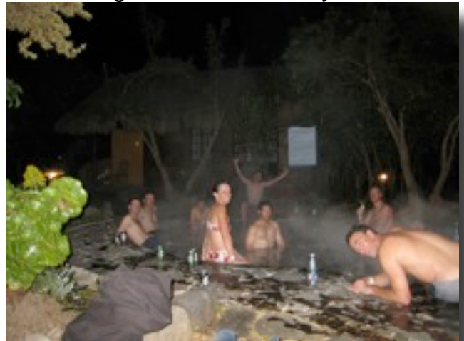
Pool party