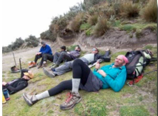
Time for a nap

my pack the last part of the descent. Once at the hut, we packed everything up and loaded it into Nacho's truck for the drive down to the bus pickup area. We did have a short wait for the bus – just enough time for a nice snooze in the sun.