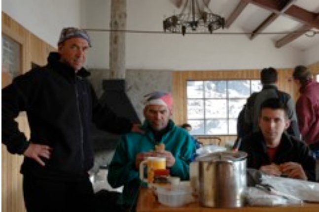
Best burritos in town!