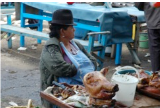
Or this?