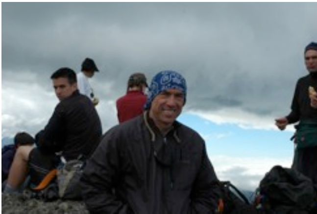
Enjoying the summit

We reached the summit in good time – the last part was an easy scramble up some volcanic rock. After a short break, snack and a few photos – we were on our way down.