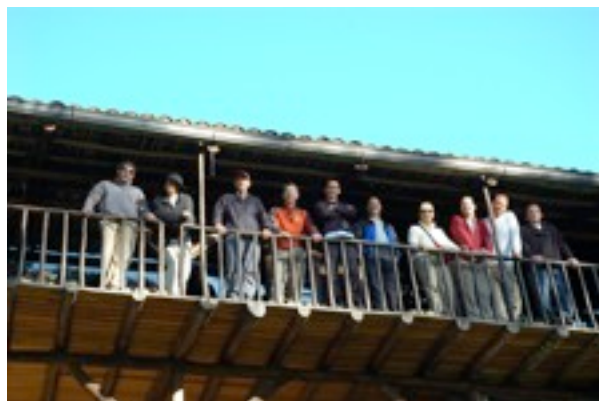
Just look at that view