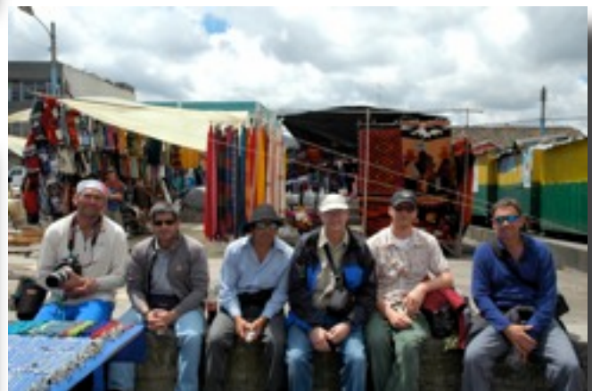
OK – we've had enough shopping!!!!