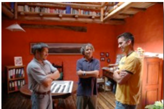
What do we do with our hands?