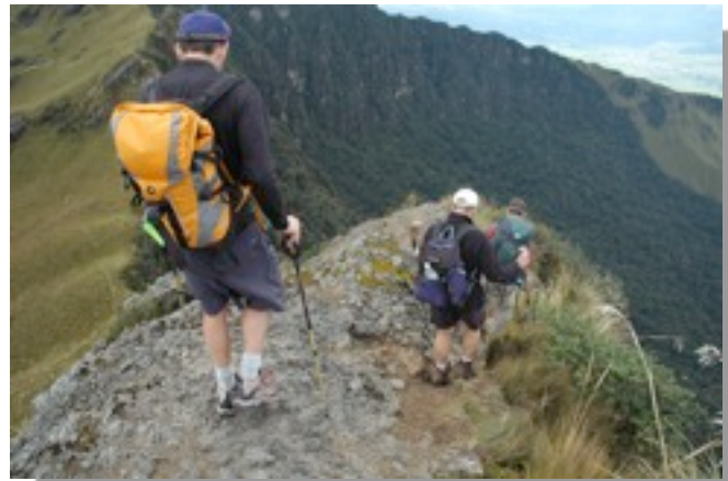
And Heading Down!