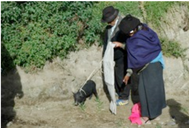
Keep on moving.....