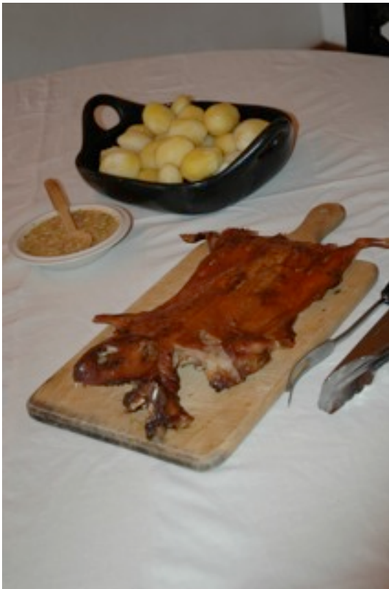
So that s what roasted guinea pig looks like