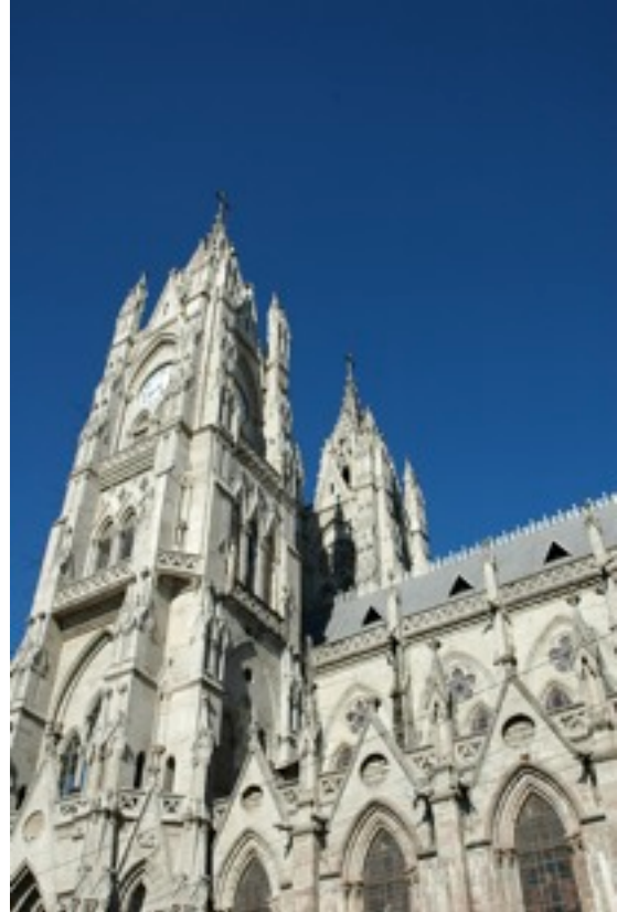
One of the many churches in Quito