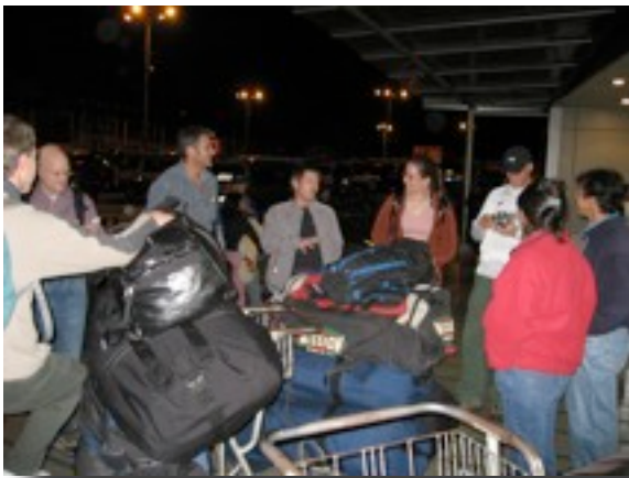
Every IMG trip starts and ends in the airport with a big pile of duffels

I was joining the group as a solo again as my husband doesn't like to climb and has a limited amount of vacation. Even though I know that he worries when I travel alone – particularly on climbing trips – he's really supportive and I know that he's proud of me.