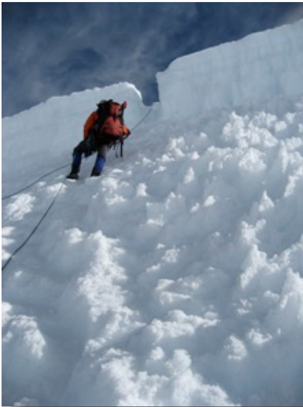
Last pitch up - Finally!