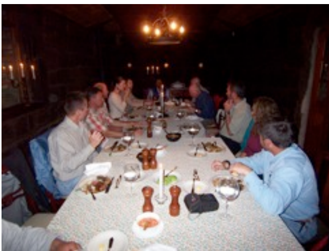
To new friends – what a place

Unfortunately, we had pretty heavy rain that evening, so there were no views of Cotopaxi in the sunset.