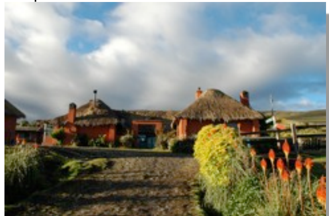
VolcanoLand – not an amusement park!

After we returned to the bus – it was on to a hacienda at the base of Cotopaxi. The hacienda, called VolcanoLand, is basically still a working farm with little cubicle rooms for sleeping and the rest of the house for the guests to enjoy. It's really a beautiful setting complete with horses and llama's in the fields. They had a lot of very nice antiques and folk art in the house which made for a cozy atmosphere.