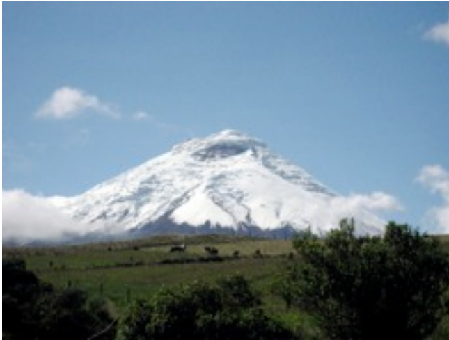
Cotopaxi

My goal was to try to keep some food and fluids down so that I could recover my strength for the climb the next night. And I thought I was doing pretty well.