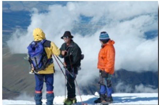
Getting ready to go down