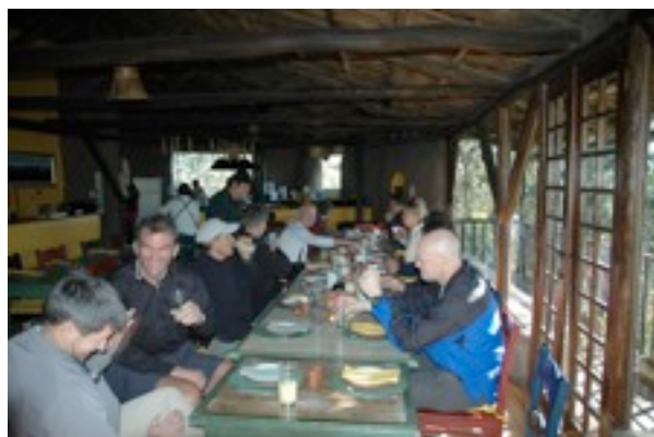
Breakfast at La Matilda's