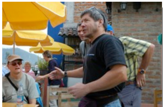
OK Gang - lets just keep it simple

We moved back up the road thru the rest of the “grocery store” stands of pig heads, fruits, vegetables and canned goods to the edge of the tourist section. But we had not yet had breakfast – so of course we needed to stop and eat. We ate a small café with outdoor seating looking down on the market. Phil attempted (again) to “keep it simple” by just ordering scrambled eggs and juice. Of course – we had to be complicated by mixing in a few omelets and bacon into the mix. After eating – we spent a couple of hours shopping (some of us came back with more than others) and then it was back to the hotel to pack up and head back to Quito.