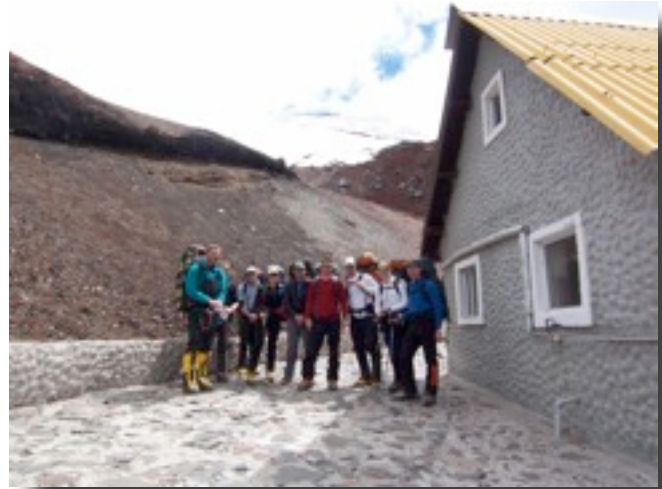
After a successful summit (for most anyway)

Jodi and I started watching for them to come down the glacier at about 11 or so – but they apparently had some issues coming down as we didn't see them until close to 1 PM. One of the concerns about pushing it to the limit to get up a mountain is that you still need enough reserve to get back down. Jodi and I were happy to see everyone when they returned. Once everyone was back down, all the gear was packed up and we headed down to the bus.