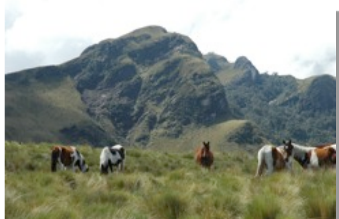
What a view!

Roger's wife Janet did a shorter hike with our bus driver Morton while we hiked to the summit of Pasochoa. The hike is up through grassy fields and horse and cattle pastures.