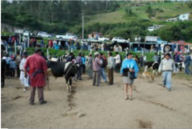
All dressed up for market!

other. The women seemed to dress up to go to market. It was divided into sections. We started in the animal section where you could see all kinds of live animals. Most were on rope type leashes. There's nothing more amazing that watching an old women with a full skirt and wrapped in a colorful shawl trying to wrestle 4 or 5 sheep along a path or an old couple trying to coax a pig up a road. But the most amazing thing was how friendly the people were.