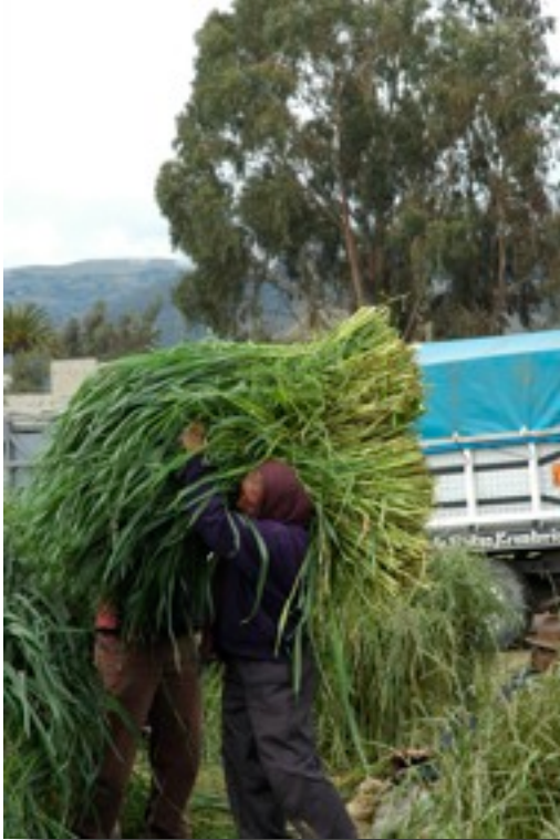
Saquisili Indian Market

The next day brought another trip to a market in a nearby village called Saquisili. I think that I enjoyed this market even more than the one in Otavalo.